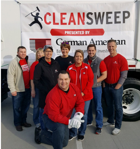
German American Bank volunteers engage in community cleanup through Clean Sweep Days.

In 2013 German American Bank initiated Clean Sweep Days to engage bank employees and nonprofit volunteers to work together in cleaning up roadside trash to instill community pride and make a positive impression on visitors. Nonprofit organizations receive donations from the bank for every full bag of trash their volunteers collect, averaging $300 earned for their work. Through 2019 the bank has donated over $100,000 to local nonprofits through the program.