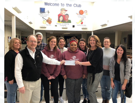
Boys & Girls Clubs of Wayne County is among the community causes supported by First Bank Richmond.

First Bank Richmond focuses on four areas of community service: education; financial literacy; physical and mental health; and support of local not-for-profit organizations. Education and financial literacy are addressed through the bank's participation in Every Child Can Read's 3rd Grade Academy, Junior Achievement and School is Cool, as well as The KNOW, an online financial education program.