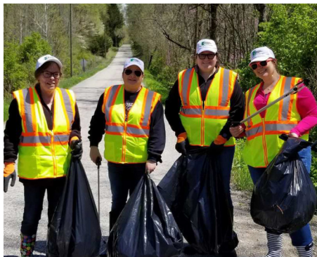
Volunteers from Riddell National Bank clean up roadside trash.

Staff are given paid time off to participate, and all related fees are paid by the bank. Additionally, the bank buys items for silent auctions and purchases tables/tickets for fundraisers. The bank also has many church and faith-based organization leaders and volunteers on staff.