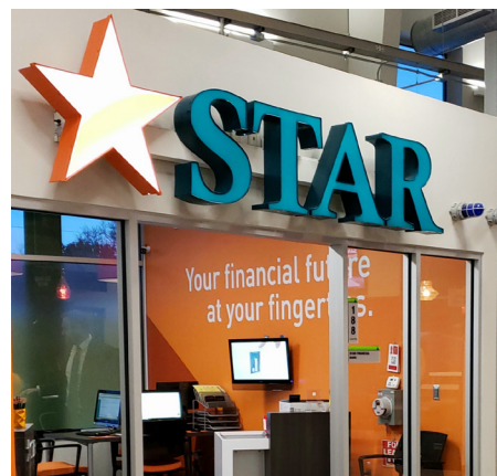
STAR Bank supports Northern Indiana Junior Achievement in various capacities, including sponsorship of a BizTown bank branch.

In addition to Junior Achievement, in 2019 employees donated over 1,700 hours of time within their communities through organizations including United Way of Allen County's Annual Day of Caring and Victim's Assistance. STAR's Volunteer Time Off program provides every employee with a minimum of eight hours of paid time off per year to volunteer.