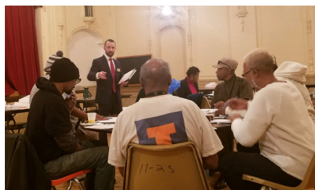
A financial preparedness workshop is presented by Peoples Bank, Munster, in partnership with the Gary Housing Authority.

All employees are encouraged to participate in entertaining activities that raise funds for employee-selected charities that the bank matches. In 2019 the bank's employee-led committee raised $52,986, providing donations to 22 local charities.