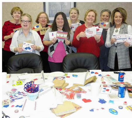
Kentland Bank staff mailed handmade Valentine's cards to local veterans in appreciation of their service.

Kentland Bank is supportive of organizations including Junior Achievement, chambers of commerce, Rotary Club, the Newton County Fair Board, CDC Resources Inc., Shriners Hospital, Goodland Lions Club, Aubrey's Angels, Earl Park Fall Festival Committee, Iroquois County Genealogy Society, Iroquois County Historical Society, Iroquois-Ford County Farm Bureau Young Leaders, United Way of Kankakee & Iroquois County, Kiwanis Club, Juvenile Justice Council and Masonic Lodge.