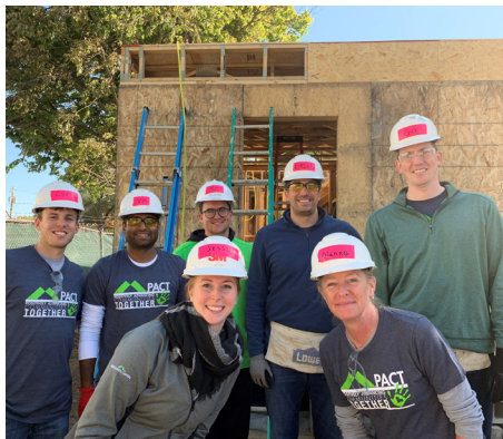
Merchants Bank of Indiana employees lend building skills through the bank's MPACT program.

Communities Together through employee volunteer service hours. At the time of award submission, the bank was still tracking 2019 data, but in the prior year more than 50 employees logged a total of 520 volunteer hours.