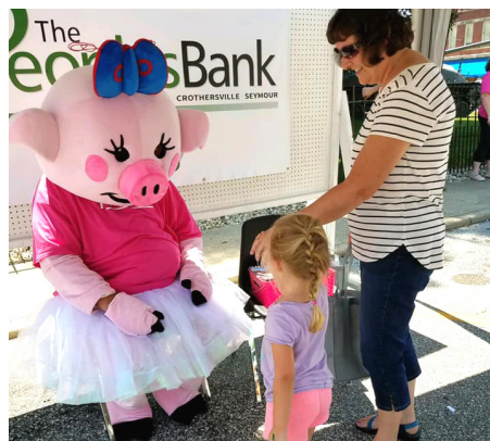
A young admirer chats with a friendly pig at The Peoples Bash, hosted by The Peoples Bank, Brownstown.

Employees are recognized for their community service at the bank's holiday party, with a special award presented to an individual who provided exceptional service. As an example, one associate created a Warm Heart, Warm Toes project, providing shoes and socks to children in need.