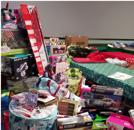
Employees of Bippus State Bank donate each year to Love INC of Huntington County to bring holiday cheer to children.

Committed to fulfilling its mission with service beyond words, Bippus State Bank uplifts the citizens and businesses of its community in various ways, including giving priority to local enterprises when making purchases and conducting other business. The bank also provides financial contributions to area organizations, both profit and nonprofit, for community support.