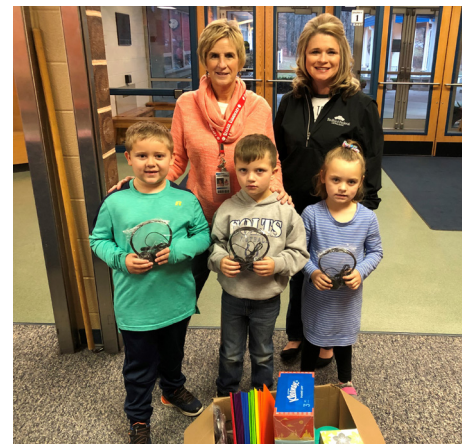
A school supply drive hosted by Bedford Federal Savings Bank provides for students in Lawrence County.

"Where Community Comes First" is not only the slogan of Bedford Federal Savings Bank, it also serves as the bank's guiding principle of committing to community through leadership, volunteerism and monetary donations. In 2019 Bedford Federal provided approximately $99,000 in financial assistance to benefit more than 65 organizations. One project was hosting an eight-week school supply drive for each elementary through high school in Lawrence County, during which employees donated a different school supply item each week. Additionally, some customers were inspired to participate.