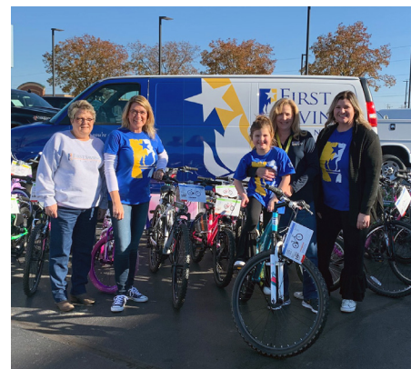
First Savings Bank staff and family members help with "Bikes or Bust," providing bicycles to Toys for Tots and The Salvation Army.

bank also has an employee-led and funded charity fund.