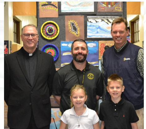
First Federal Savings Bank supports scholarships to families of students at Huntington Catholic School.

More than 95% of staff contribute to the United Way. Associates additionally contribute through a donation program that is tied to wearing jeans on Fridays, and staff lend leadership talent to board service for Junior Achievement, United Way and other community groups.