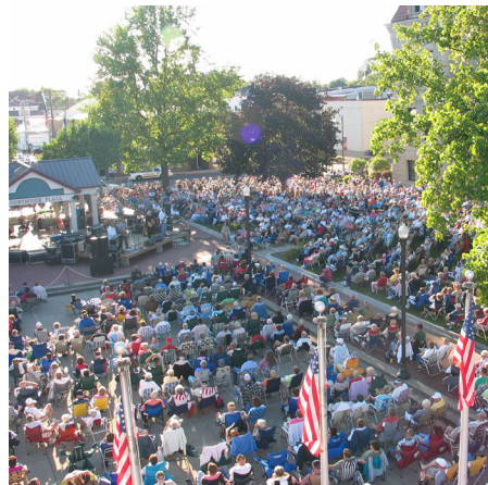
The Wright Brothers Band performs at a community concert sponsored by Greenfield Banking Company.

At all performances, the bank has four to six employees in attendance to hand out schedules, engage attendees and assist with seating. Each week, a different bank officer introduces the performances. The first year of the program, approximately 3,000 members of the community attended 13 performances, with more recent seasons averaging a total of 8,000 to 10,000 attendees.