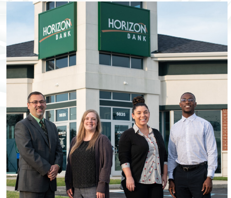
Volunteers from the Lima Road branch of Horizon Bank donate time and talent to the community.

Other educational outreach includes a workshop series to teach area high school students about banking and first-time homebuying. Further initiatives include loan and deposit programs such as Home Pride Mortgage, Fresh Start Loan and Fresh Start Checking; and a partnership with the Federal Home Loan Bank of Indianapolis to provide grants for down payment, rehab and accessibility modification.