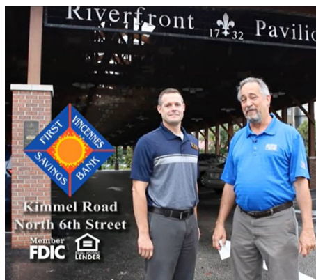
First Vincennes Savings Bank sponsored a fundraiser concert for United Way of Knox and Crawford counties.

Humanity, educational foundations, leadership programs, clothing centers, Lions Club, Children and Family Services, Kiwanis, United Way, Backpack Blessings and chambers of commerce.