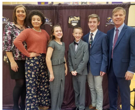
First Harrison Bank assists students of East Washington Middle School with the Amazing Shake competition.

Bank staff and a board member assisted in 2019 at both levels of competition in Indiana, forming such a strong bond with the students that all bank volunteers were present at the school for the announcement of finalists, despite the bank being in the final stages of a conversion process. The bond between bankers and students was further reinforced when the students were invited to meet the members of the bank's board of directors.