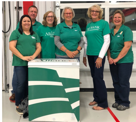
Alliance Bank staff assist at the Rensselaer Fire Department open house during Fire Prevention Week.

Staff actively help identify gifting priorities and initiate every act of giving. One example is "Giving Tuesdays," which engage staff in local philanthropy. The bank also supports financial literacy through Junior Achievement and by maintaining a junior board of directors to give hands-on board experience to local high school students.