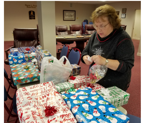
Gifts are wrapped and ready for area families adopted for the holidays by employees of Bath State Bank.

awarded the same amount to all 17 causes nominated. Employees also personally provided groceries and gifts to four area families for the Christmas season, and baked more than 1,200 holiday sweets to deliver to area shut-ins and nursing homes.