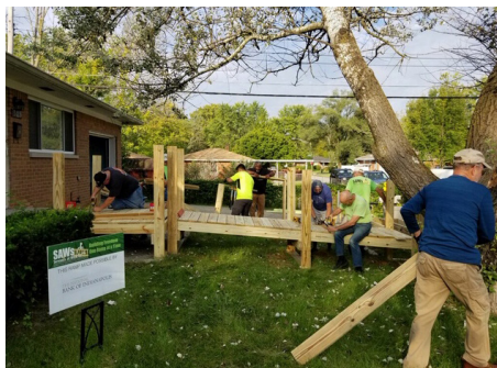
Staff of The National Bank of Indianapolis build an accessibility ramp through Servants at Work Inc.

Each employee is given one paid workday annually to volunteer at a nonprofit of choice, in total donating 1,500+ hours within a one-year span. Outreach includes financial literacy, with the bank providing space, materials and dinner to teach young people in foster care or recently emancipated about budgeting and writing checks. The bank's workforce also