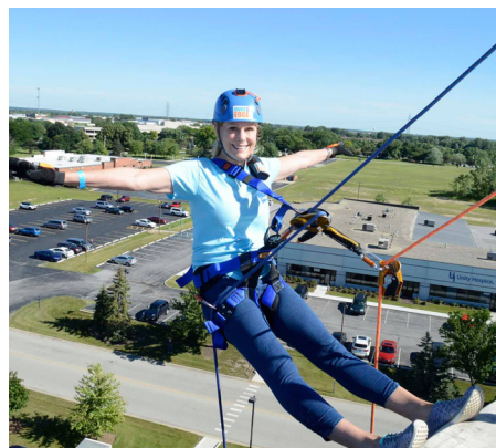
Last fall some 50 Centier Bank associates rappelled down the corporate center building, raising more than $61,000 for northwest Indiana charities.

One example of community connection is the bank's annual volunteer fair, when it