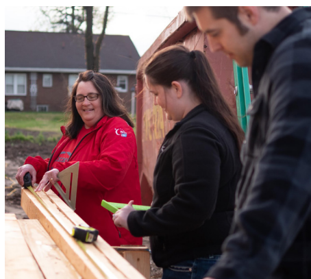
Home Bank personnel lend a helping hand to Habitat for Humanity, one of many causes supported by the bank.

Recipient organizations of the bank's gifting program are evaluated by the standard, "Are we making lives better?" Outcomes of the Home Bank gifting program include job training for local residents, improved