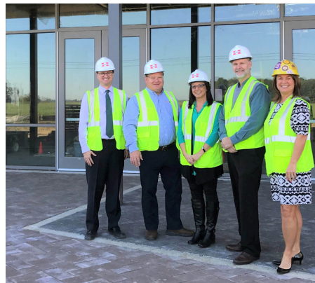
Community First Bank of Indiana funded the creation of a community patio at Ivy Tech Community College-Kokomo.

At the beginning of each year, the marketing team works with nonprofits to determine needs and set budgets, and employees are encouraged to submit service records for rewards. Associates also may participate in a CFB Cares committee, contribute $5 on Fridays in exchange for wearing jeans, and have the opportunity to engage in service projects on designated closure days. In 2019 the bank gave some 6,000 hours of service, with employees contributing more than $8,500 and the marketing budget supporting over $100,000 in donations.