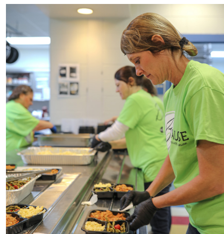
Last Columbus Day, employees of First State Bank of Middlebury participated in B Cause Day, volunteering at nine local nonprofit organizations.

Staff is encouraged to engage in community activities in the form of committee memberships, board of director seats, private organization activities, school functions, church